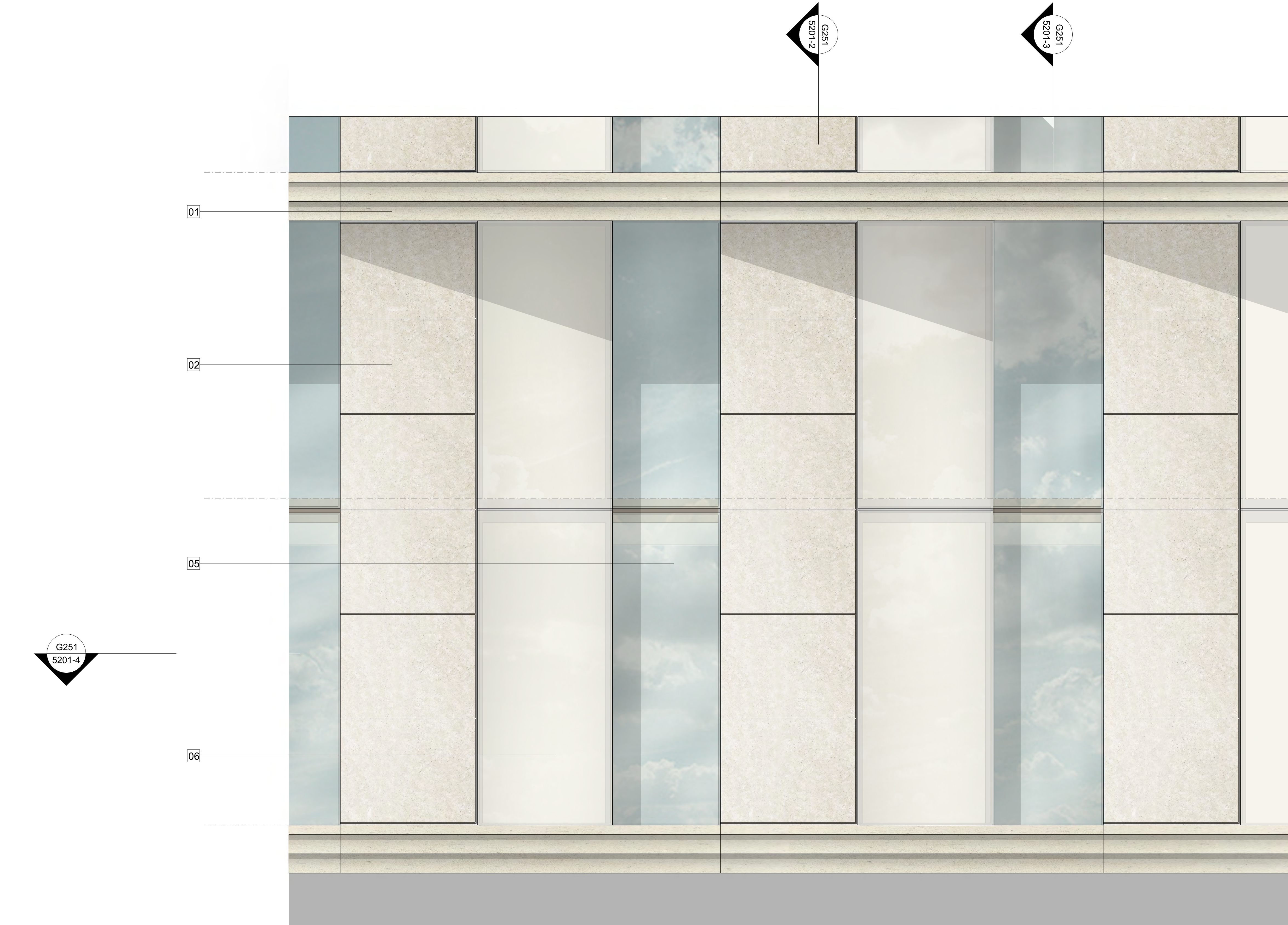
G251 5200-1 Detail Elevation